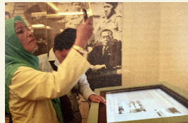
Photo: The Women's and Youth Movement Corner at Vredeburg Museum 2012.

In 2012, the Vredeburg Museum counter-narrated by revitalizing its archive. They hosted multi-media materials and used aesthetics to make archives more appealing, thus, accessible to the public.